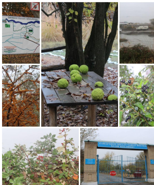
Figure 1. Zarafshan National Nature Park (39°40'10"N, 67°05'43"E).

The Zarafshan National Nature Park is located in the middle part of the Turkestan and Zarafshan mountain ranges. It is supplied with water by the Zarafshan River and its tributaries. The Zarafshan River is one of the largest river systems in Uzbekistan and Central Asia, extending approximately 770 km from east to west. Owing to the diversity of soil and climatic conditions, the Zarafshan Valley possesses a distinctive natural environment. For this reason, the Zarafshan River basin is divided into three parts: the upper, middle, and lower Zarafshan. The Zarafshan National Nature Park (with an area of approximately 2426.4 ha) is situated in the middle reaches of the Zarafshan River [1] [2] (Figure 1).